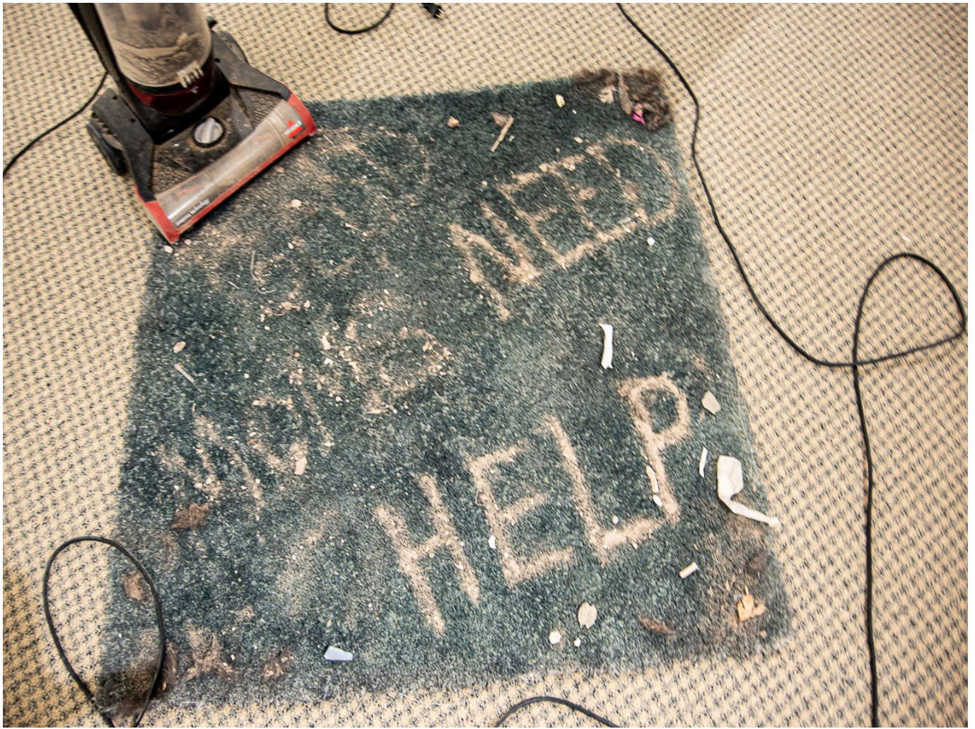
Good Moms Need Help 1 , 2021, vacuum, carpet, dirt. 48"x 60"x 60".

Mary Kelly's work, Post-Partum Document , was immensely beneficial in my research for both concept and materials. This series discusses the dominance of the mother-child relationship but breaks away from the traditional Madonna and child imagery 3 . Kelly's work is groundbreaking because she brings to light the development of the mother, unlike, what is most commonly discussed, the mother-child relationship or the socialization and development of the child only. Kelly uses 'transitional objects' such as diaper liners, feeding charts and typed conversations with her child, to discuss this complex relationship 4 .