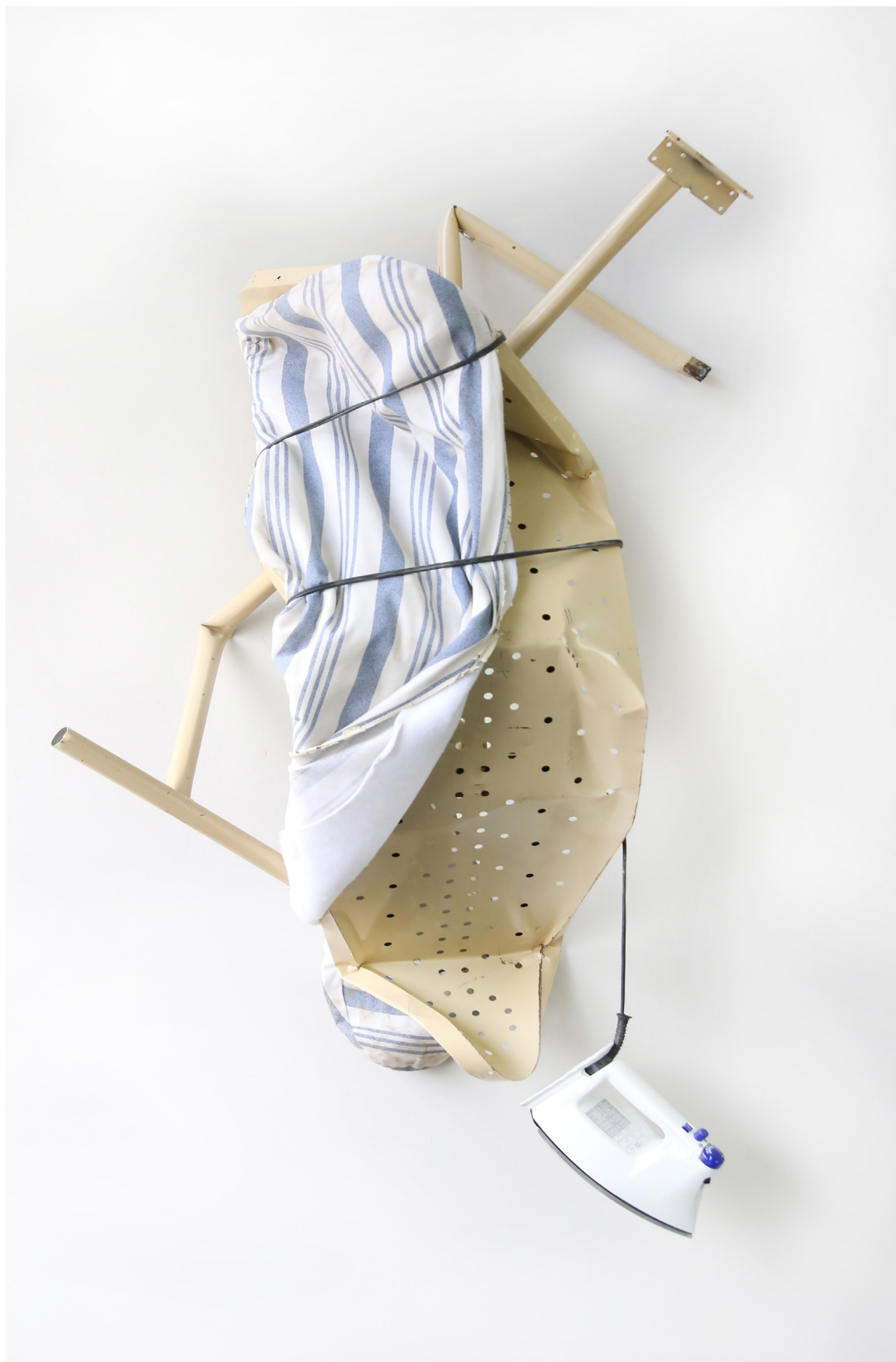
Good Moms Need Help II , 2021, ironing board, iron. 24" x 48" x 12".