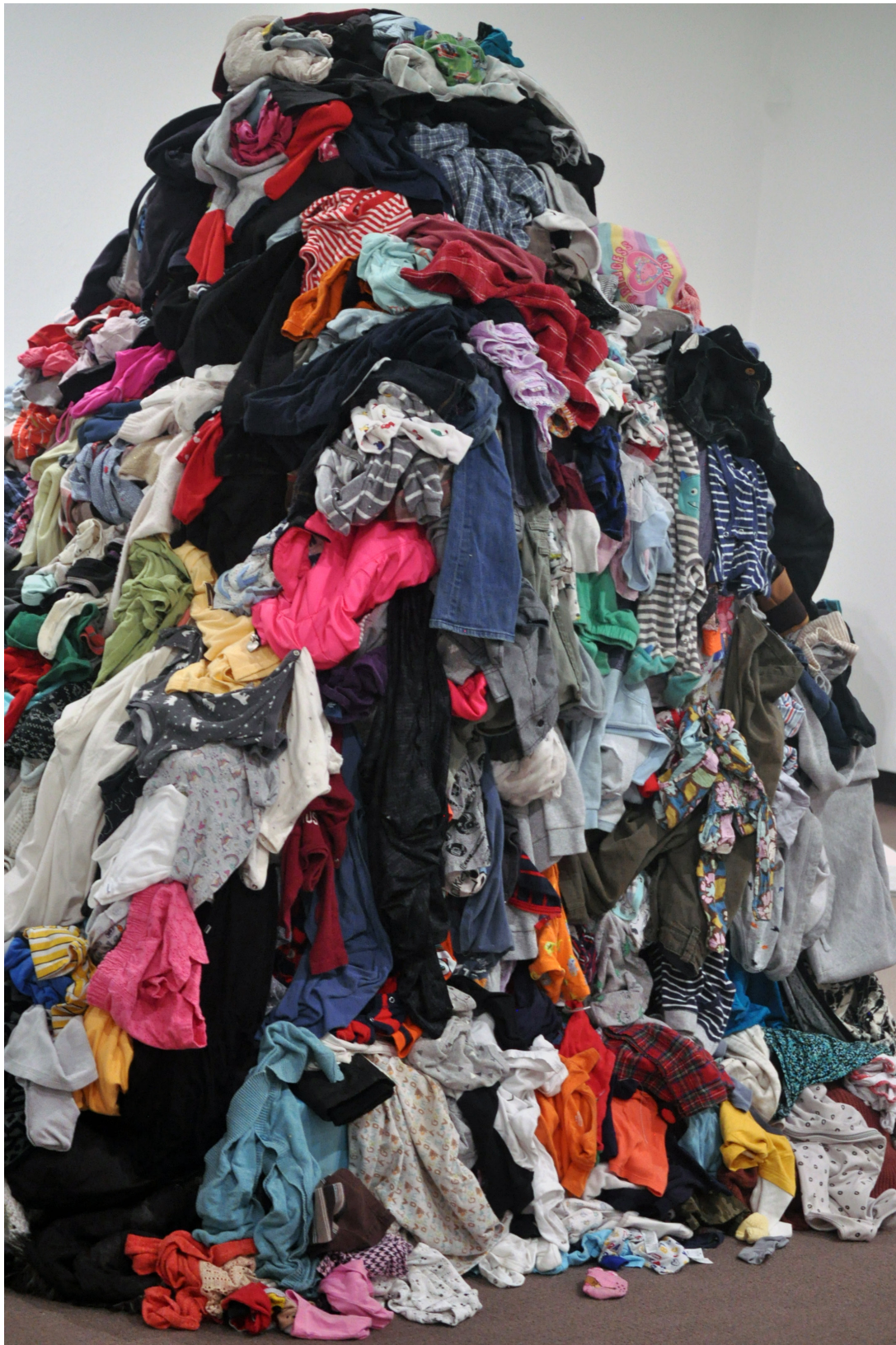
Good Moms Can Get Overwhelmed , 2021, clothes. 60"x 96"x 60".