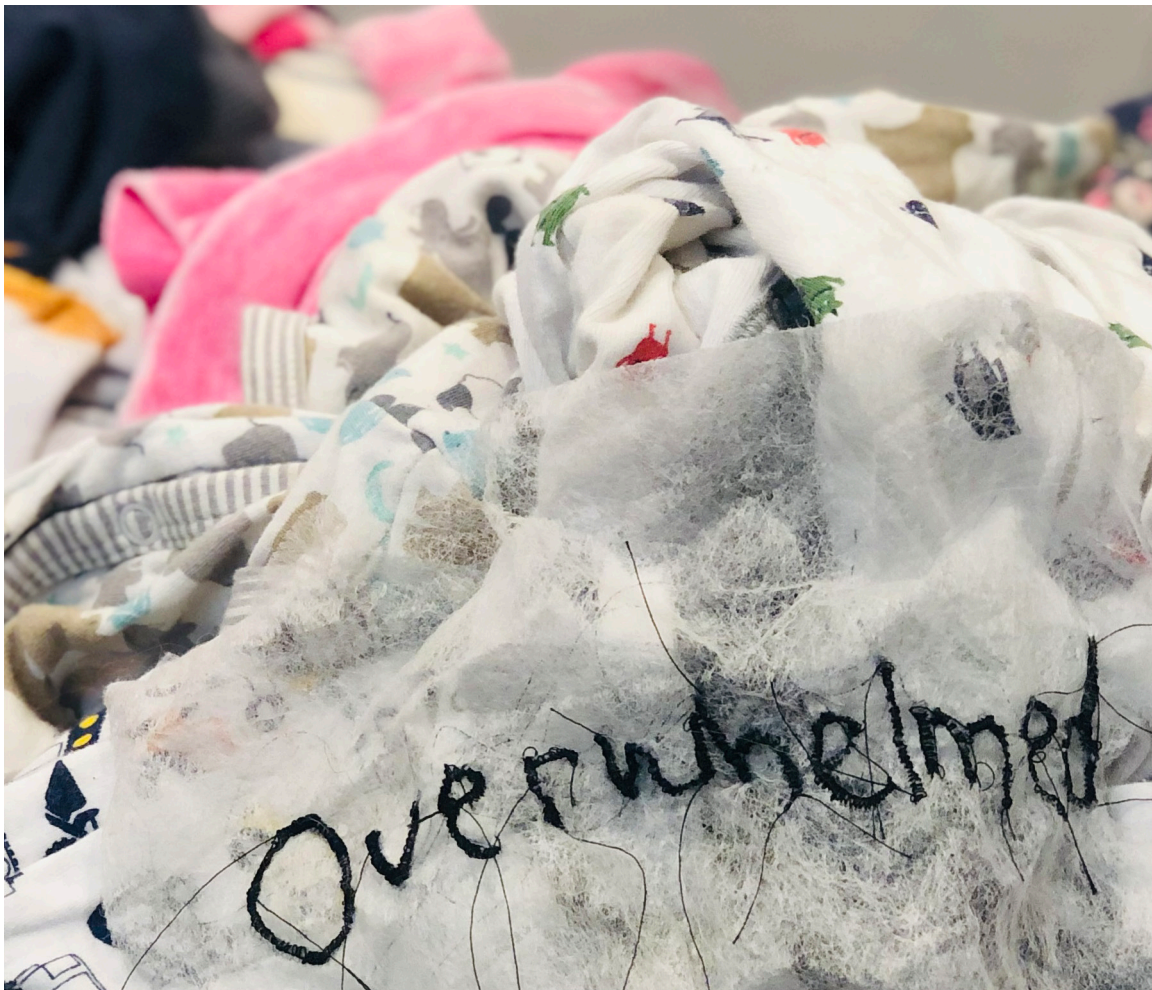
Good Moms Can Get Overwhelmed detail, 2021, clothes. 60"x 96"x 60".

Tracey Emin's My Bed , and Everyone I Have Ever Slept With were huge inspirations for me in gaining the courage to discuss my private life on a public scale. Like Emin, I wanted to create moments from my life and bring them into the gallery. Showing the daily battles, I had not only during lockdown, but a normal day as a mother. Choosing domestic objects that you find in an average home, especially a home with children. I knew I wanted an artists' touch and my claim of authorship to be apparent in all of my work. Yes, these are objects you can find in your home but the way I have recontextualized each piece will tell you my personal story. Emin took the chaos of her room after a break up and placed it in a gallery with her piece, My Bed . She created a moment where you feel as if she has just walked away from this space, it is so real, lived in and unfiltered. She kept condoms, dirty underwear, liquor bottles and left the bed a mess 1 . This is a moment most would hide from the outside world, but instead she has put it all on full display.