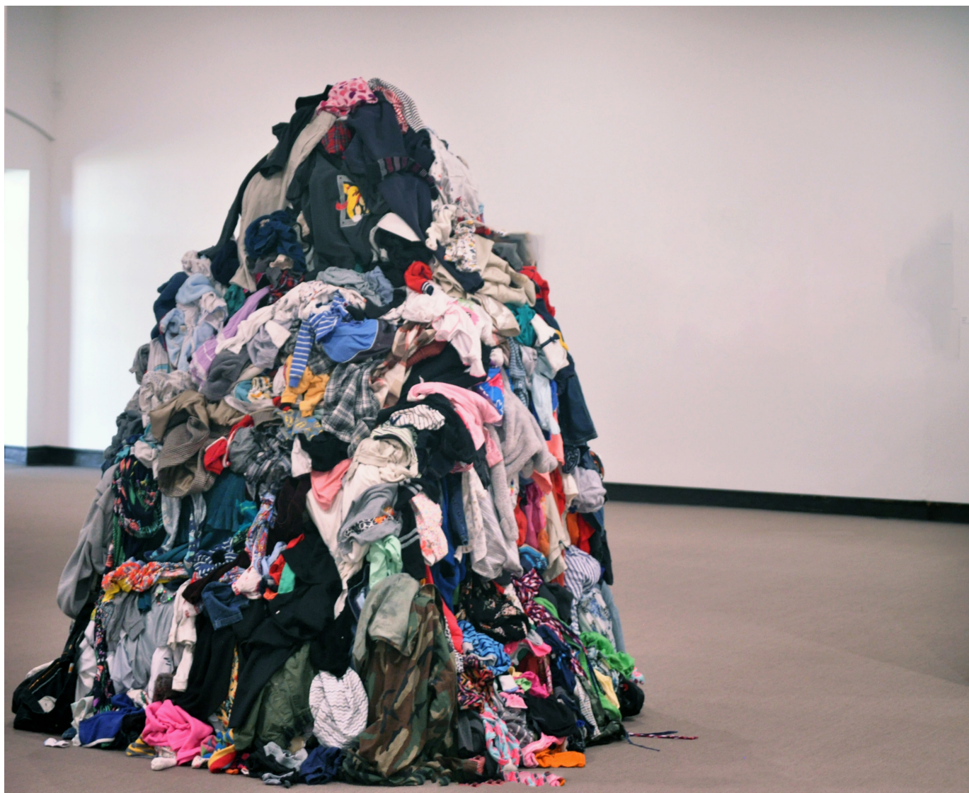
Good Moms Can Get Overwhelmed , 2021, clothes. 60"x 96"x 60".

My piece Good Moms Can Get Overwhelmed allows the viewer to see what I normally try concealing from the world. I want it to appear as if I have it all together, but the reality is I am just doing the best I can like everyone else. This larger than life size pile of clothes depicting how simple mundane tasks, like laundry, can manifest into something so much larger. This task stares you down, it is overbearing, slowly intruding into your space. It's taking over everything in its path, becoming something that you can no longer ignore. I use laundry for several reasons. Commenting on historically being housework performed by a female, but also to express my frustrations about the household obligations that now consume my life.