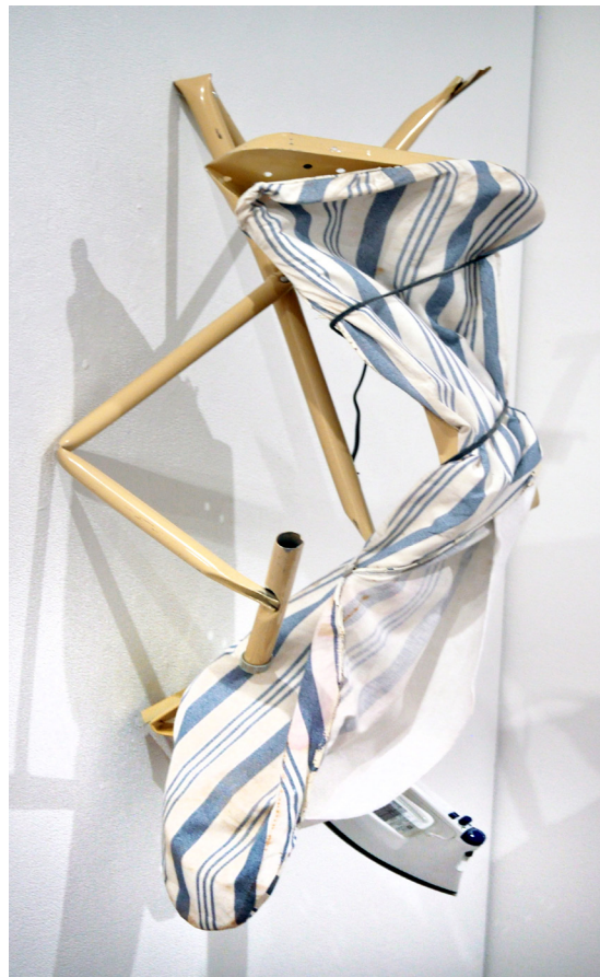
Good Moms Need Help II detail, 2021, ironing board, iron. 24"x 48"x 12".

My work may appear selfish at times, but I think that is ok, and should become the societal norm. It is a part of the job description as a parent that your needs become second to your child's, but your needs must not be forgotten. The work that I am creating allows me to release my frustrations about domestic life, and motherhood is a part of that. Recognizing my faults as a person, as a mother, and learning from them can only make me better at my job. I visually express the exhaustion I feel from the seemingly constant and endless amount of housework with Good Moms Need Help . I used a domestic object, an ironing board, I then bent and twisted until it became useless. Useless in the sense of being an ironing board. It appears sad, tired, it is trying desperately to perform its duties but can't. I should be able to discuss my feelings and frustrations without ridicule but that is not often the case. I am often met with, "you'll miss these days," resulting in my feelings being again disregarded, and as if I can feel nothing but happiness about motherhood or I am viewed as ungrateful. Will I miss this time in my children's lives? Absolutely. Is it also valid that some days the housework and messes they create are exhausting and make me go crazy to the point I complain, absolutely.