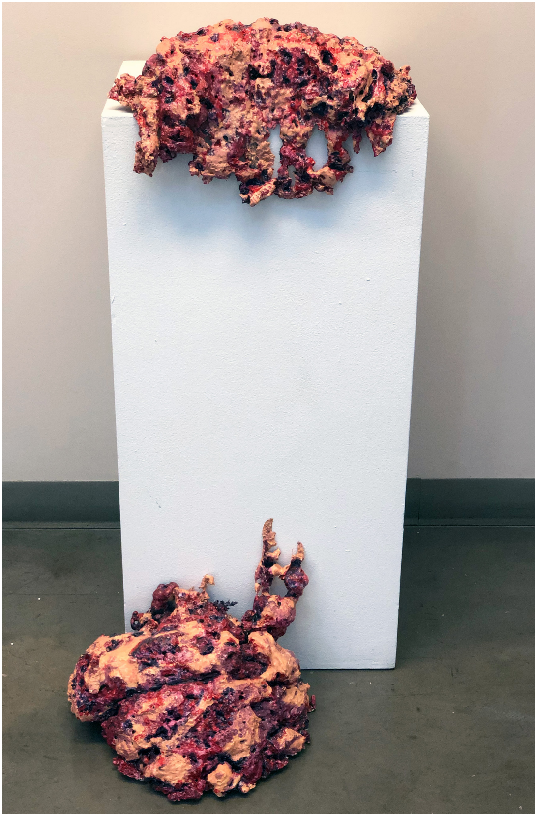
Anxiety Series I , 2019, foam, acrylic paint. 18" x 8" x 10".