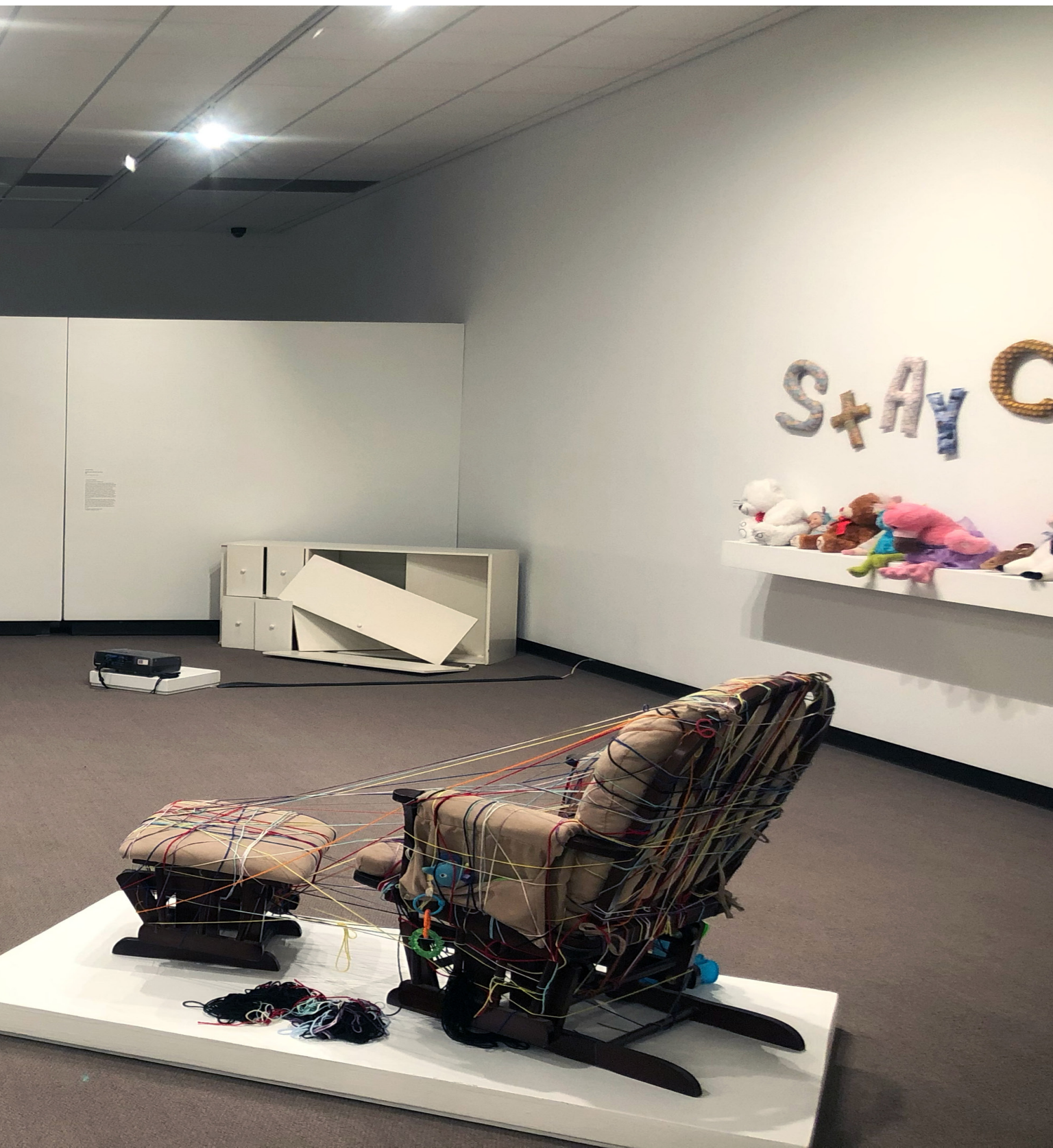
Image from MFA in Visual Studies Exhibition , 2021, digital capture. Dimensions vary.