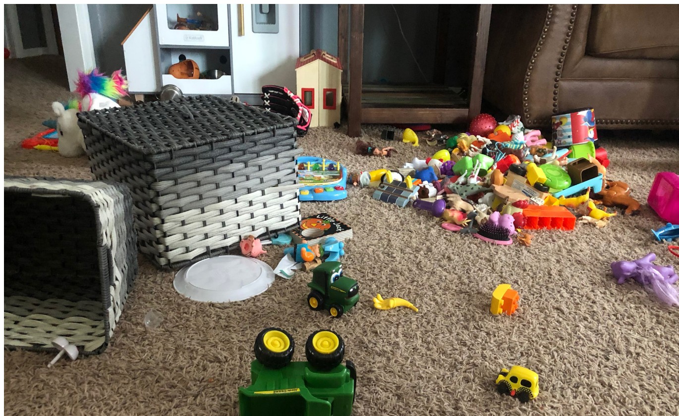
Toy Box Crash , 2021, digital capture. Dimensions vary.