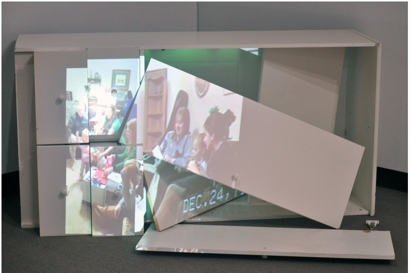
You'll Understand When You Have Kids detail, 2021, dresser, digital videos. 63"x 34"x 32".

The videos projected onto it are what keep me going, they are the reasons I don't let the anxiety attacks keep me down for long. I have videos of moments from my childhood placed next to videos of my children. They are projected onto the dresser and appear distorted changing the original image much like the lifespan of a memory. Some pieces get lost along the way; my only hope is that my children will remember the good times as I do now.