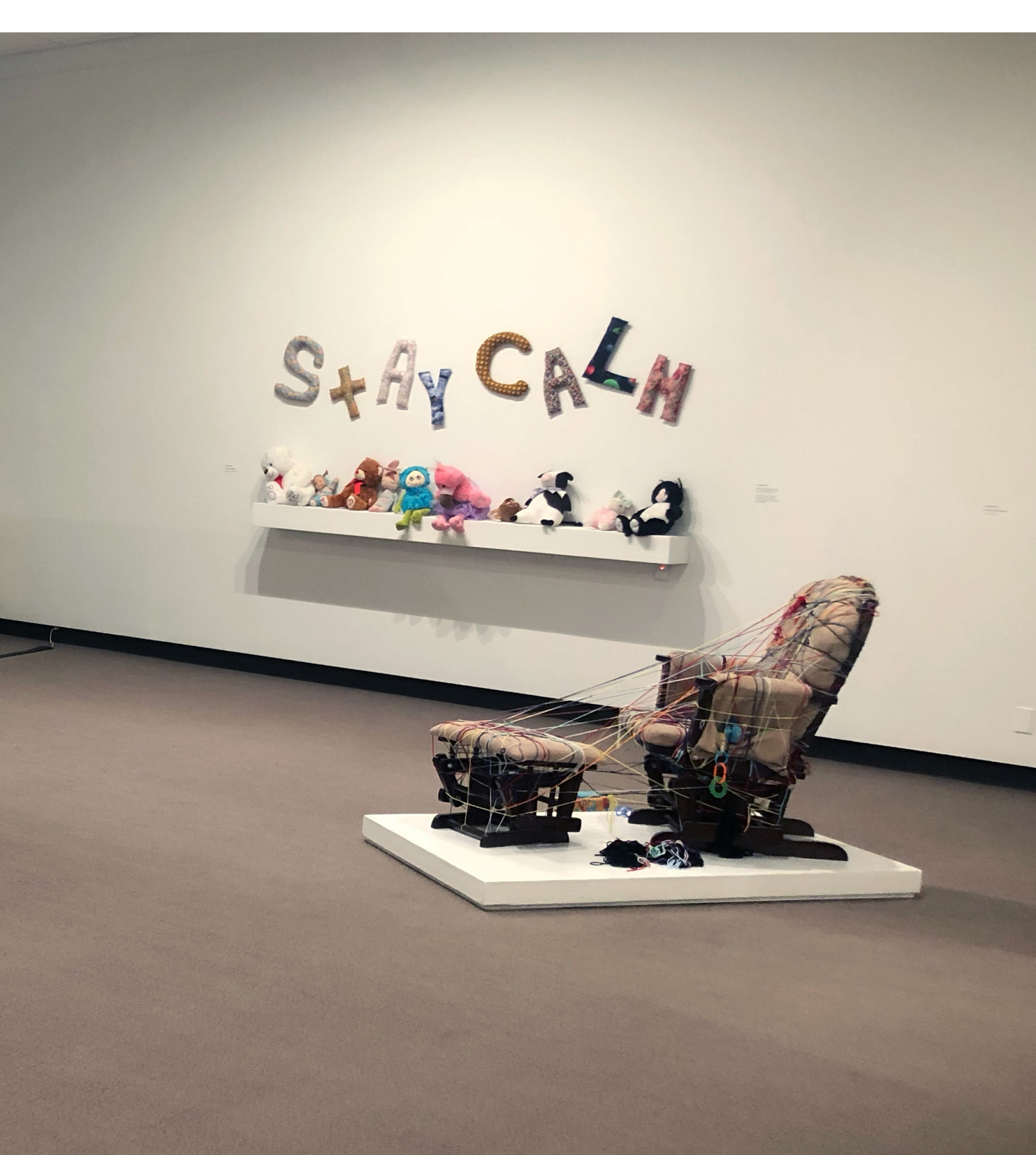
Image from MFA in Visual Studies Exhibition , 2021, digital capture. Dimensions vary.