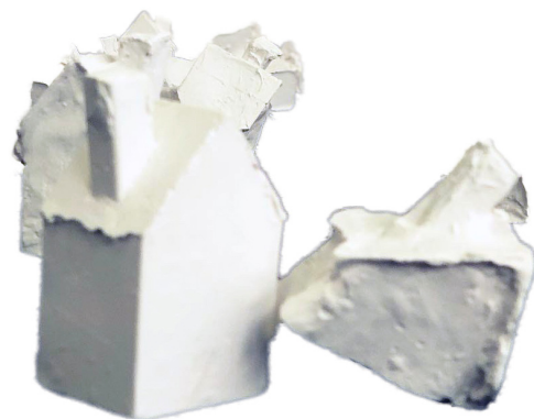
Structure Without Structure detail, 2019, plaster. 45”x 40”x 45”.

My sketchbook has always been more of a diary, with a few strung-out rushed sketches thrown in between entries. Through my entries I came to the realization that I have dealt with anxiety most of my life. Now, my artistic practice provides me with an outlet and is a form of catharsis. My thesis work is about one of my lowest and most shameful moments as a parent. However, it was in this moment when my artistic practice started in a new direction and ultimately led to this series, The Good, the Bad, and the Unspoken: Complex Layers of Motherhood .