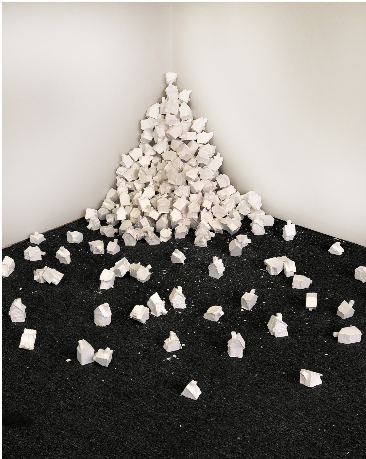
Structure Without Structure , 2019, plaster. 45" x 40" x 45".