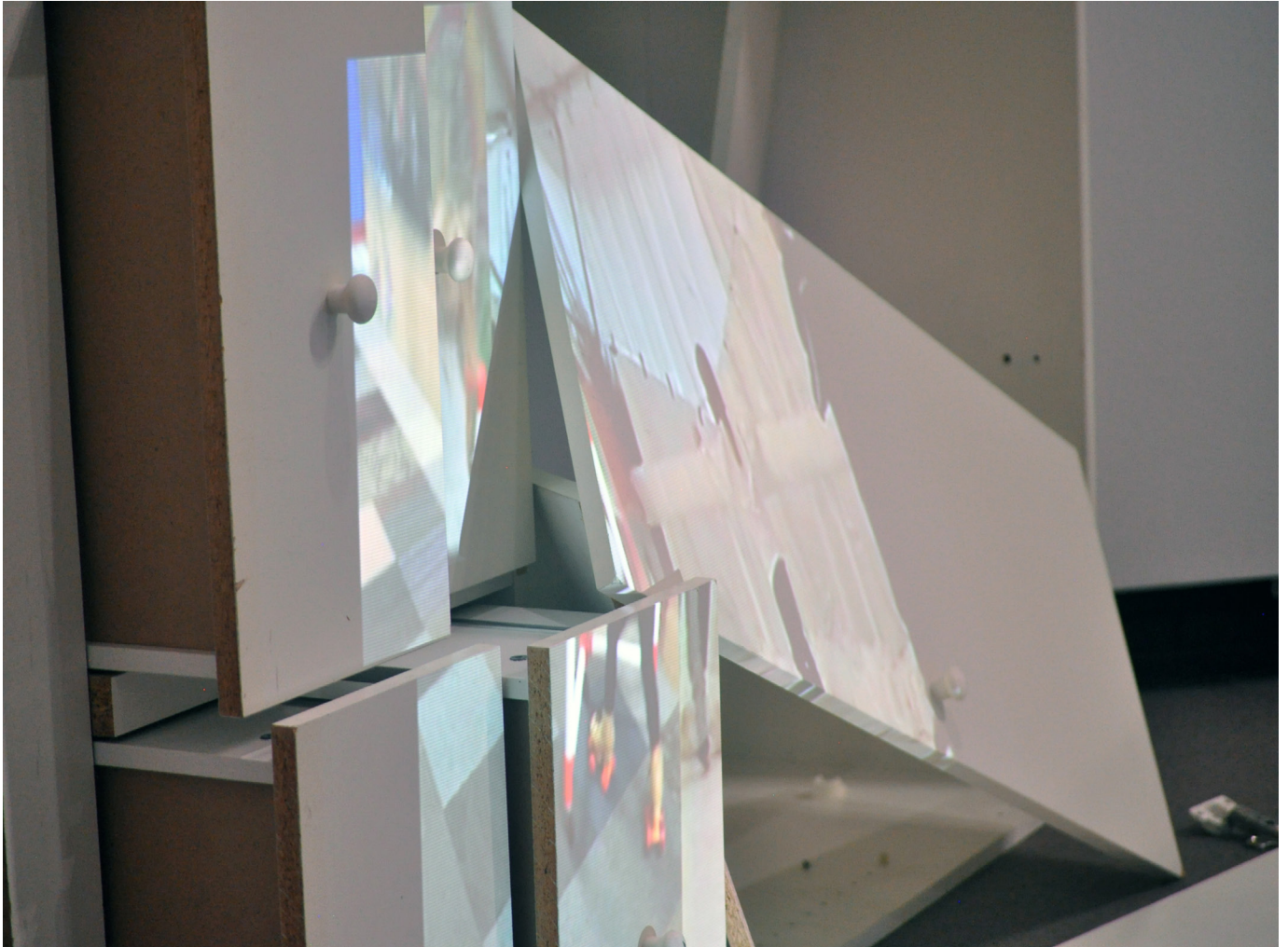
You'll Understand When You Have Kids detail, 2021, dresser, digital videos. 63"x 34"x 32".