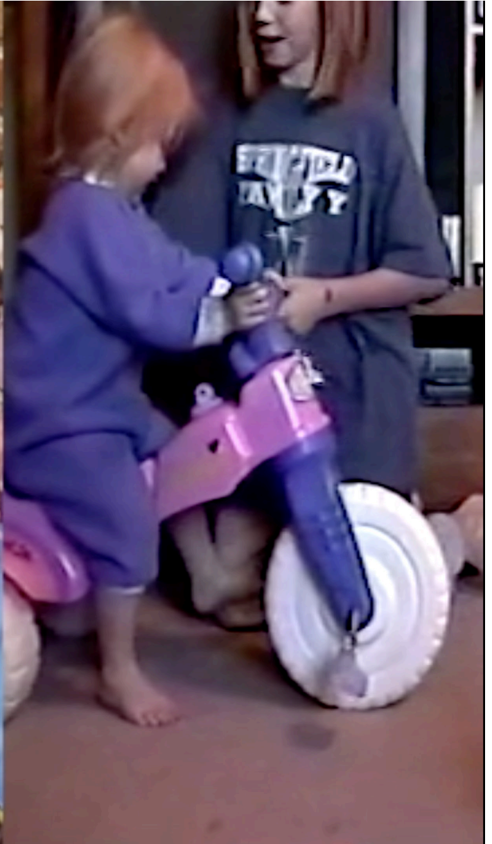
Film still from You'll Understand When You Have Kids , 2021. Dimensions vary.