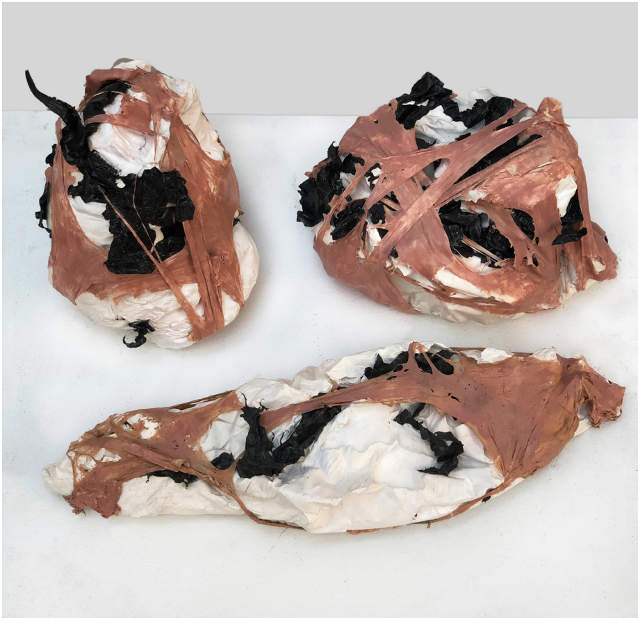
Anxiety Series II , 2019, plaster, latex, plastic. 20"x 25"x 30".

Louise Bourgeois is an icon when it comes to contemporary female artists. I find my practice parallels with hers the most. She is an interdisciplinary artist and created work about her childhood traumas, eventually evolving into work about her own experiences as a mother. Her piece, Self Portrait 1990 , is a great example of how late in her life she revisited her experience being a mother rather than focusing on her own childhood as she did with previous series such as, Cells 1 . Louise Bourgeois' work isn't about finding answers but more about working through her experiences and feelings, much like my own practice. She has contradictions in her work, love and hate, father and daughter, mother and child, the individual and the universe that she presents so powerfully. Providing the viewer, a path to understanding the mystery of the human experience 2 .