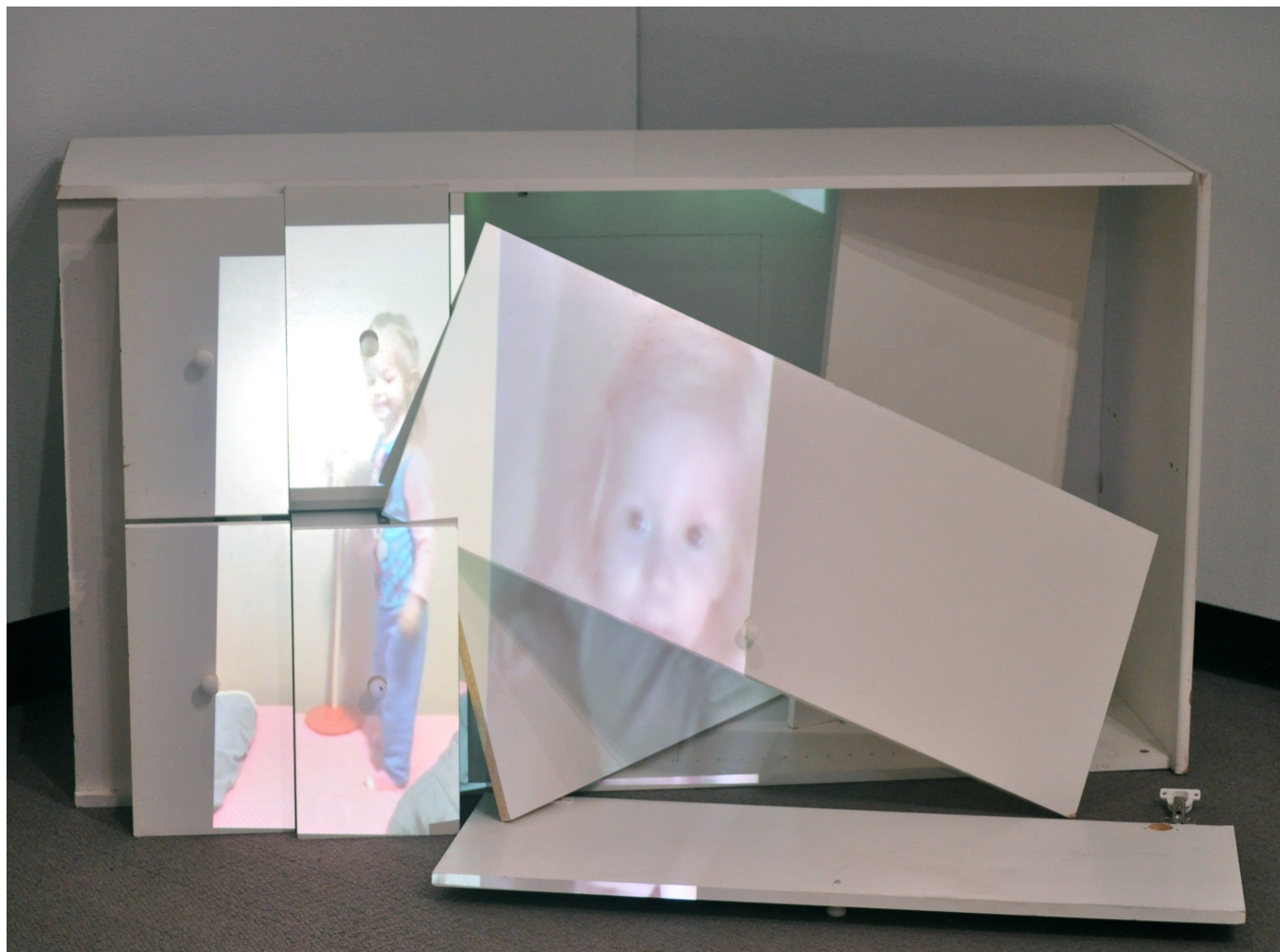
You'll Understand When You Have Kids , 2021, dresser, digital videos. 63"x 34"x 32".