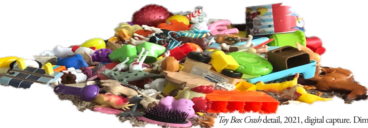
Toy Box Crash detail, 2021, digital capture. Dimensions vary.