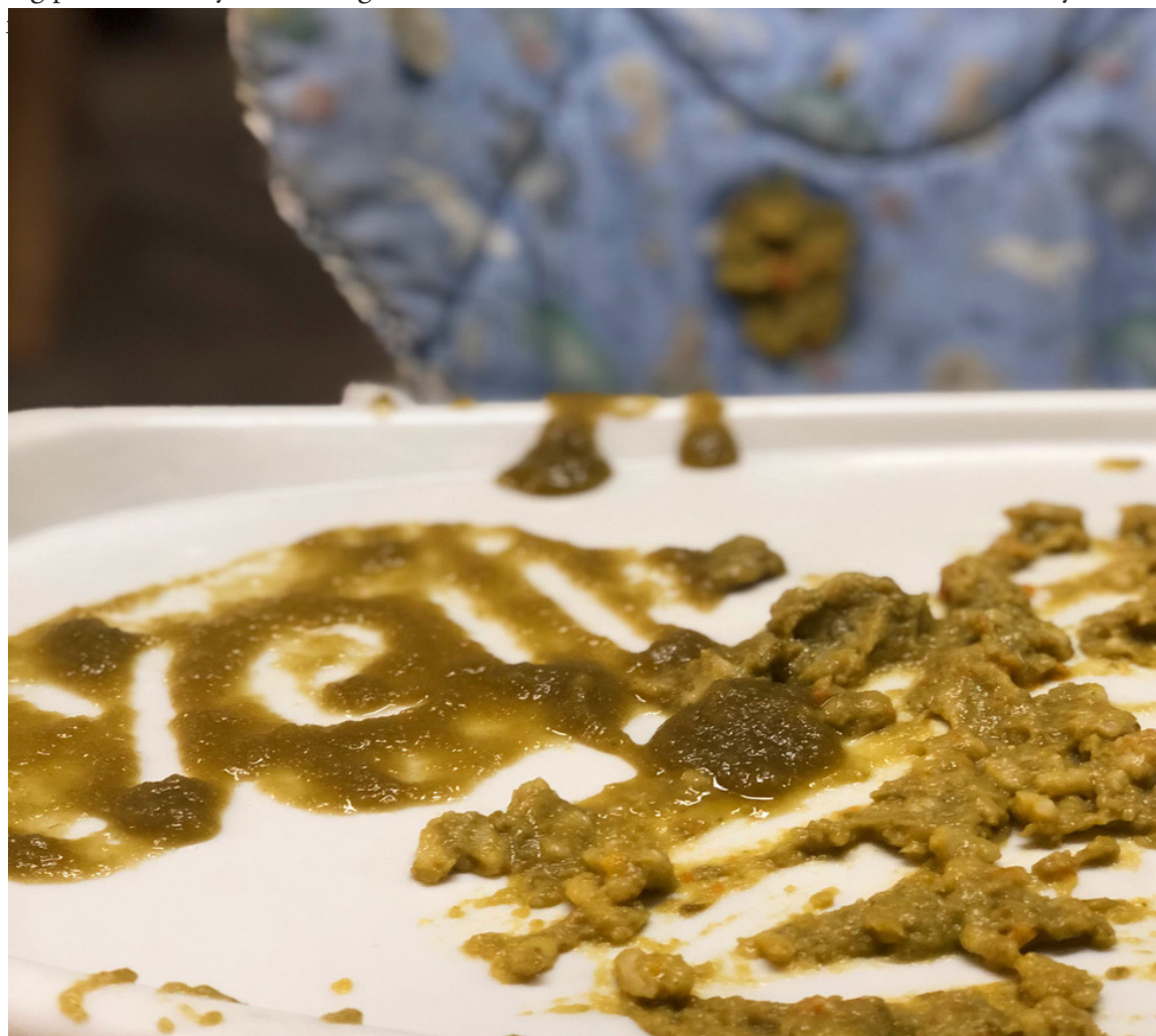
Good Moms Can Yell , 2021, highchair, babyfood. 24" x 54" x 24".

Being a full-time stay-at-home mom comes with many challenges. Good Moms Can Yell was inspired by a challenge I didn't expect at all: cooking. It felt as if my entire day was surrounded by food. Making breakfast, cleaning up breakfast, getting a snack, making lunch, cleaning up lunch, time for another snack, making dinner, cleaning up dinner and finally, preparing coffee and food for next day's excursion of constantly making food and doing dishes. Something so seemingly simple became incredibly stressful and time consuming. Putting so much effort into this to then have my children complain about the food or in my sons case, throwing food on the floor, putting it in his hair, feeding the dogs; food being seemingly everywhere but in his mouth. Without realizing it, eating became one of my shortest breaking points often resulting in yelling. Why wasn't eating together as a family like all of the mommy blogs I had read for meal inspiration? What was I doing wrong that my life wasn't like those happy pictures of babies trying new foods? My reality was yelling, "Stop rubbing your sandwich on the wall, and eat it!" I can only hope that other parents are putting on a huge façade like I do when posting pictures of my kids eating on social media. Because more often than not the reality is, it is