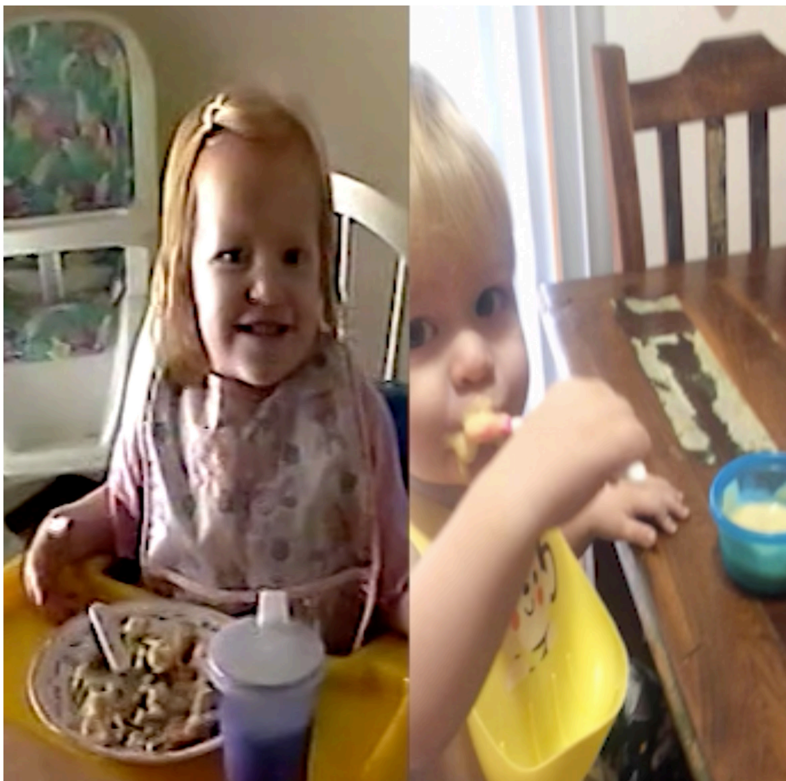
Film still from You'll Understand When You Have Kids , 2021. Dimensions vary.

Nan Goldin's work, The Ballad of Sexual Dependency , inspired me to go back and search through images and videos from my childhood as well as document my life with my children in the present. Instead of attempting to recreate what is happening in my life, I document it in the moment much like she did in this work. She used the photographs as her memories to help guide her in both life and her work 1 . You can see this inspiration best in my piece, You'll Understand When You Have Kids .