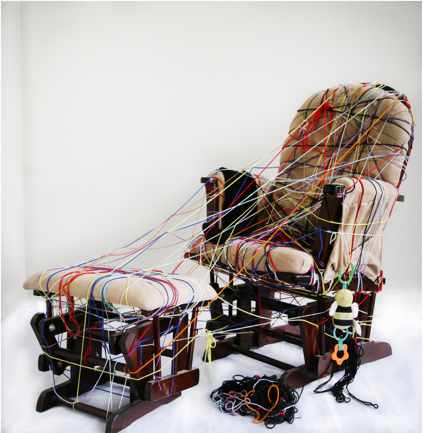
Good Moms Can Feel Trapped , 2021, rocking chair, yarn, toys. 60" x 26" x 43".