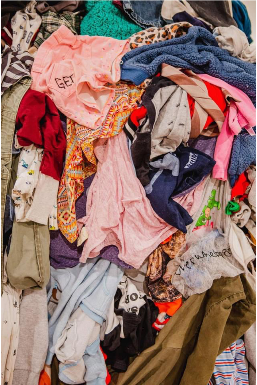
Good Moms Can Get Overwhelmed detail, 2021, clothes. 60"x 96"x 60".