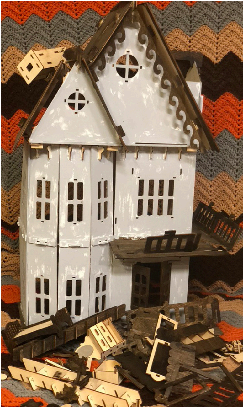
When the Dust Settles , 2021, digital capture. Dimensions vary.