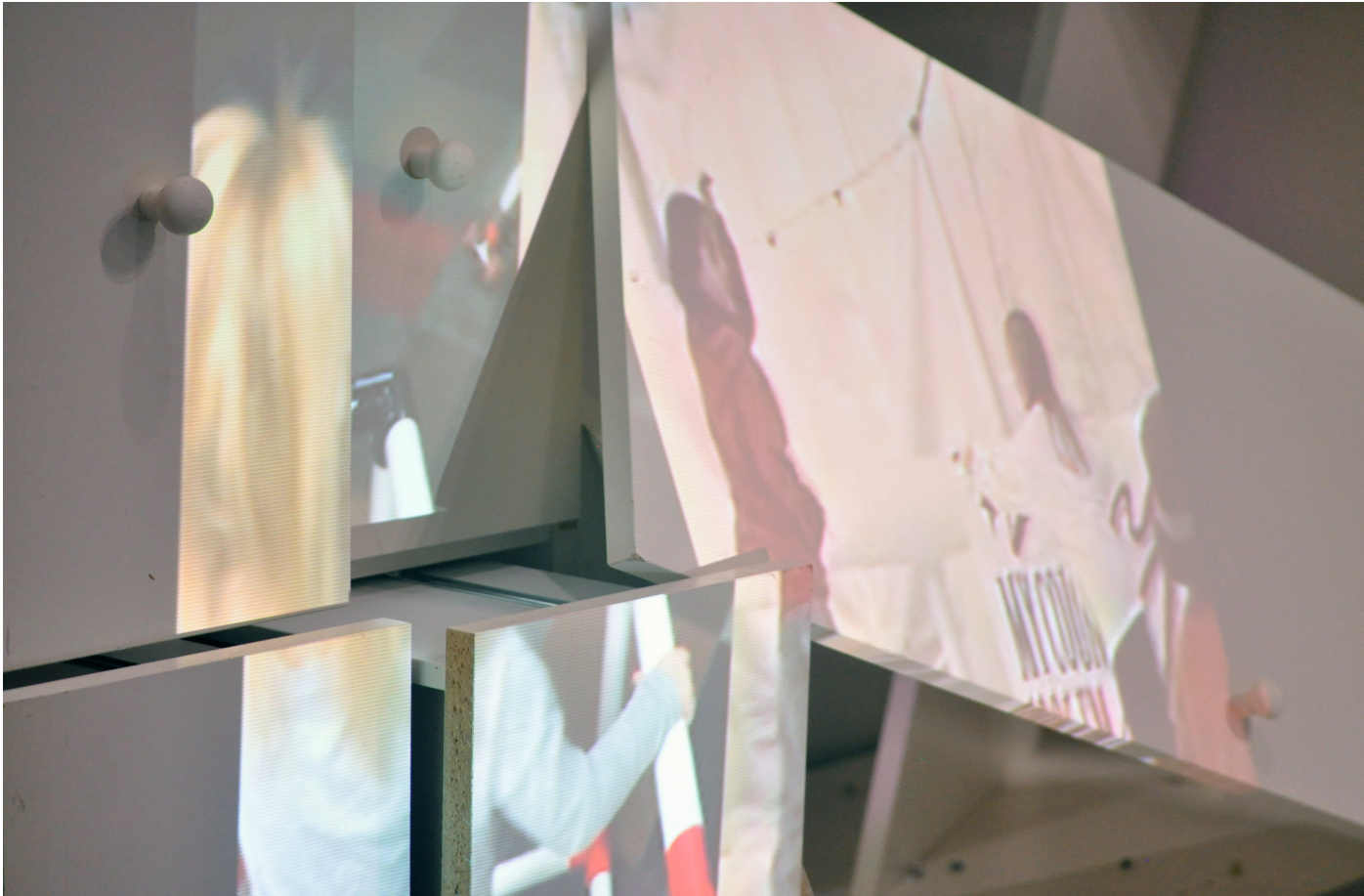
You'll Understand When You Have Kids detail, 2021, dresser, digital videos. 63"x 34"x 32".

In the midst of trying to understand my childhood, I got copies of old home movies. I had so much animosity towards my parents and about my childhood for so long. So much time was wasted trying to process my past traumas in unhealthy ways; fighting with or not speaking to my mother, holding people at a distance. Watching these videos, I was astonished. They weren't at all what I remember most of my childhood, they were filled with smiles, laughter, family gatherings, and most of all love. My childhood wasn't easy, but it wasn't completely full of bad moments like I had dwelled on for so long. I was watching my parents, sometimes younger than I am now, growing up and finding themselves. I have always said that my mom and I grew up together because she had me so young and I was treated more like an adult than a child. Now that I am a parent, I realize this is true for everyone. No matter who you are, you grow into being a parent just like any other role in your life. Everyone's path is different, some easier than others but everyone must find their way and discover who they are again after having kids. My parents did the best they could and for that I am grateful. I have let go of the anger and the hatred. Life is messy and at times gets the best of me, but that is what makes it worth living. Seeing my kids happy and healthy gives me all the motivation in the world to do better and to constantly evolve.