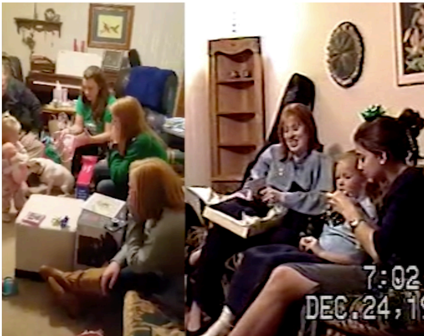
Left & Right: Film stills from You'll Understand When You Have Kids , 2021. Dimensions vary.