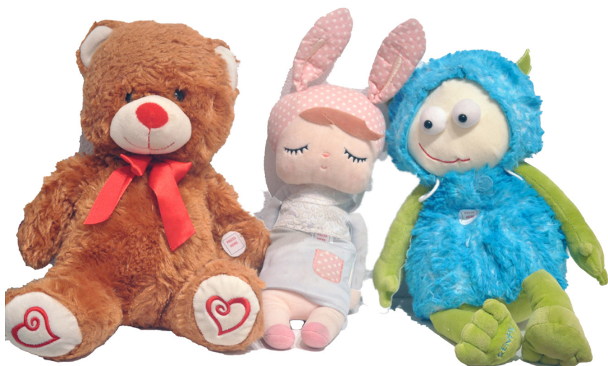
Good Moms Need Breaks detail, 2021, fabric, stuffing. 96" x 12" x 42".