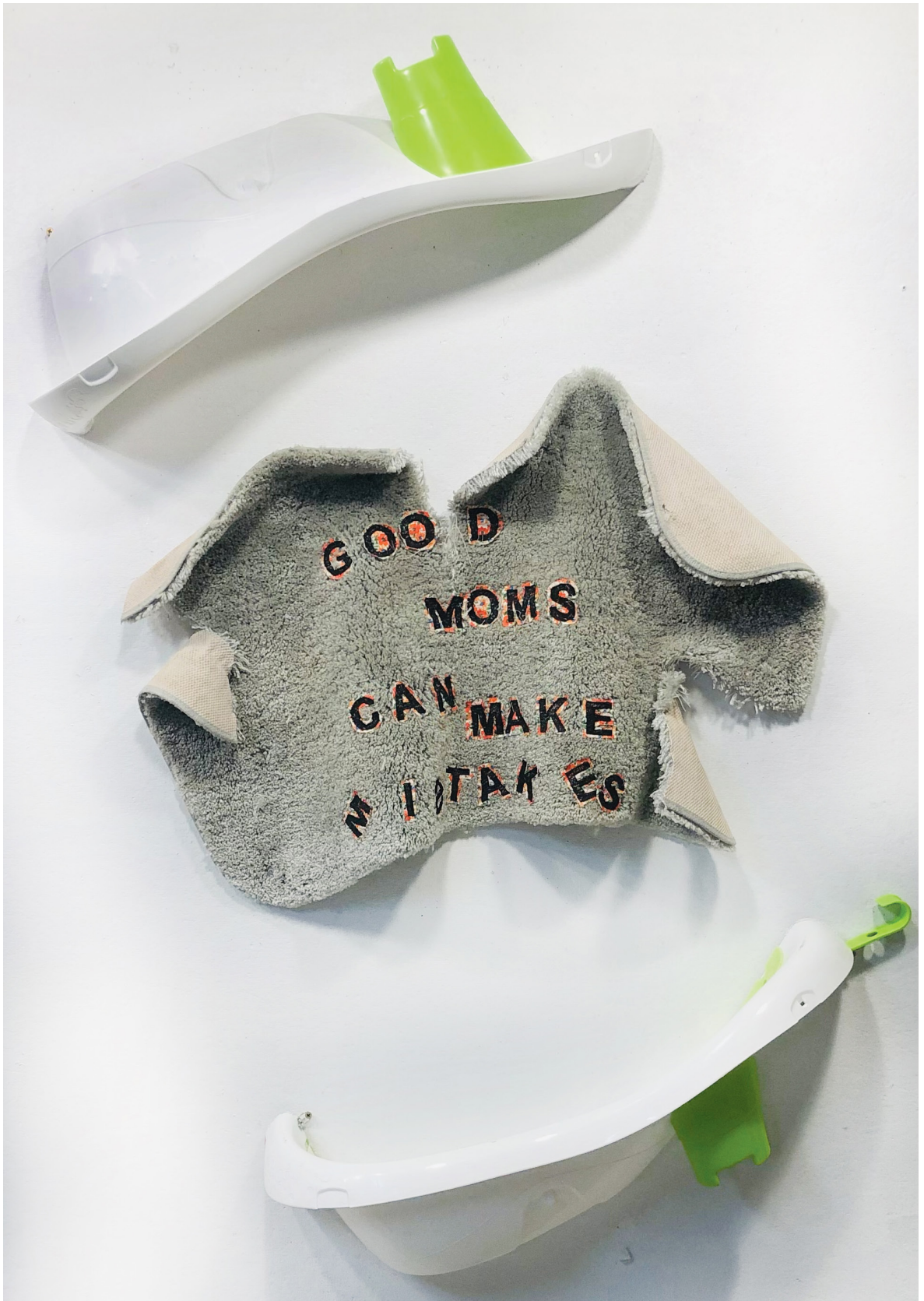
Good Moms Can Make Mistakes , 2020, bathtub, rug. 48" x 54" x 6".