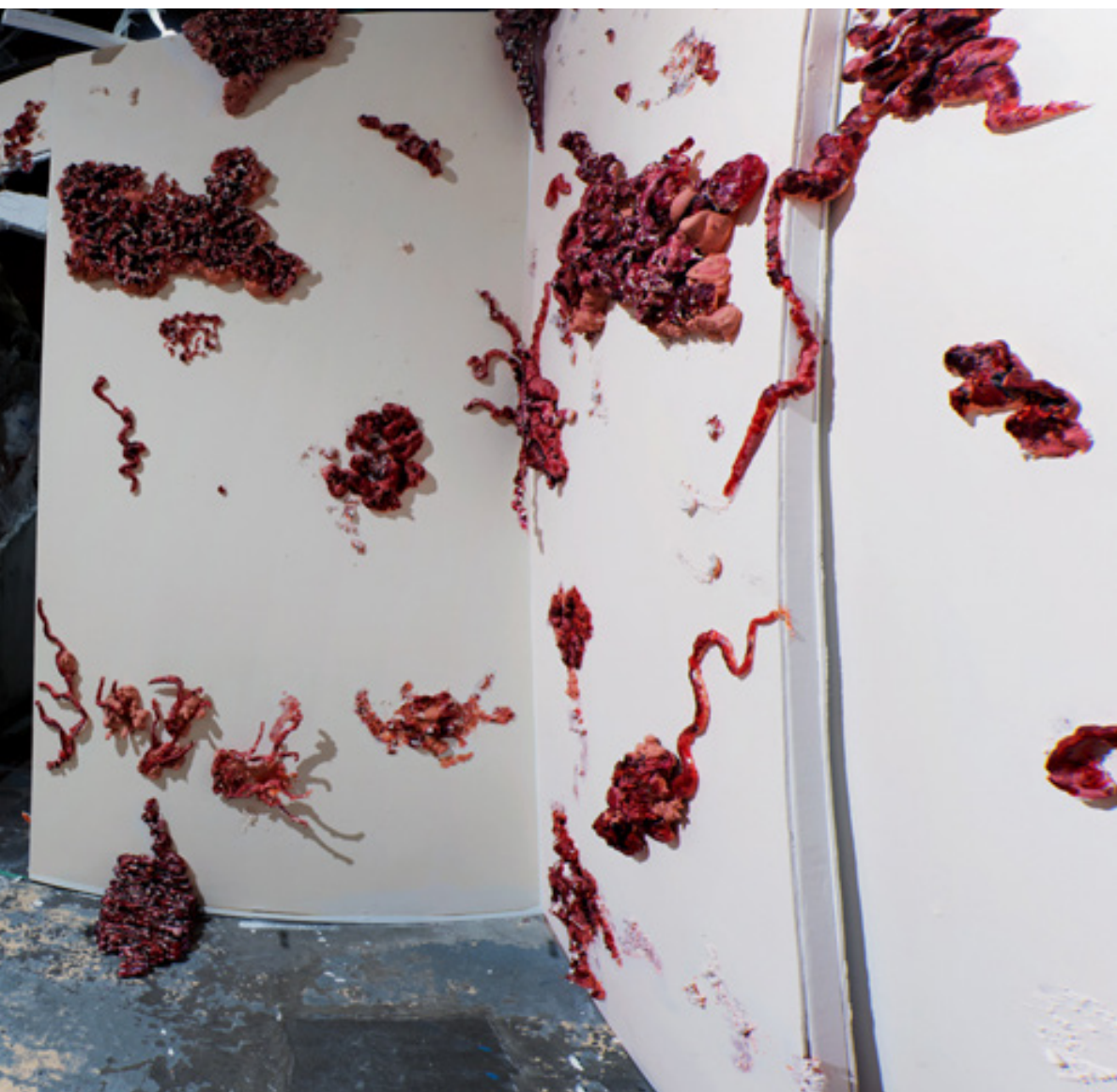
Anxiety Series IV , 2019, foam insulation, acrylic paint. 144"x 144"x 96".