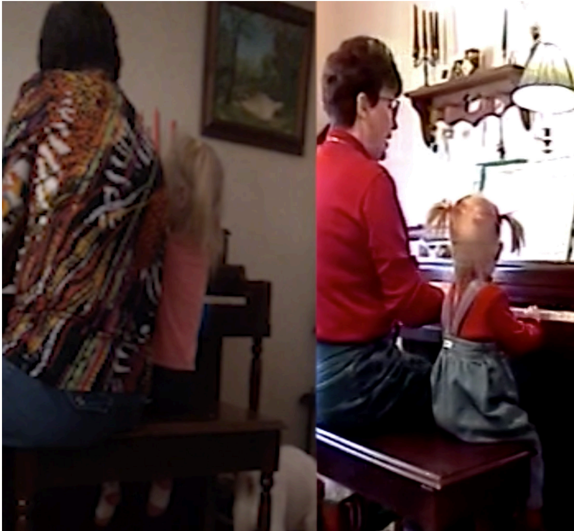
Film still from You'll Understand When You Have Kids , 2021. Dimensions vary.

Gillian Wearing's Family Stories series made me think about how sometimes I feel I am putting on a facade to the public, scared of ridicule if they were to know the struggles I sometimes feel. In her Family Stories series, Wearing created realistic masks of her family members and took photographs of herself while wearing them. She forces contemplation of a self-portrait, identity, projections, fantasies and the divisions and overlaps in the family romance 1 .